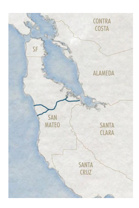
Proposed Bay to Sea Trail