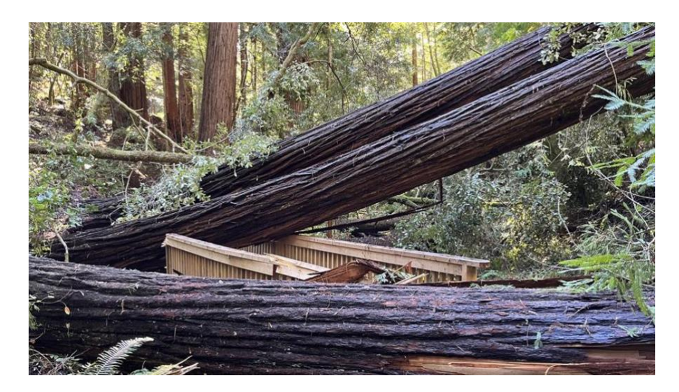
Damage at Towne Creek Bridge, Pescadero County Park